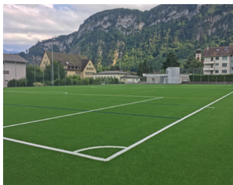
FC HERGISWIL Hergiswil, Switzerland

GreenFields MX NF is our premium woven non infill turf, developed for the athlete, with the athlete.