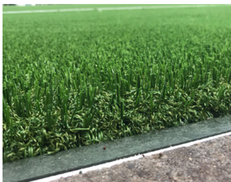
SPORT CLUB EXCELSIOR Nijmegen, Netherlands